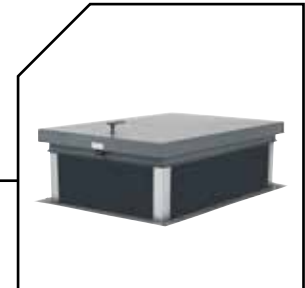
Robust steel welded handle prevents leaks