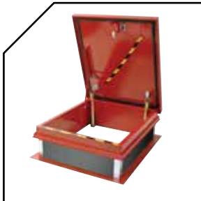
Custom colors and sizes available upon request