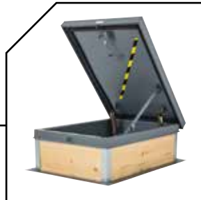
Wood fiber board insulation frame locks out the elements